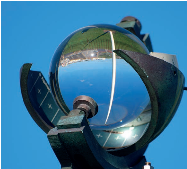
Photograph A for Question 1